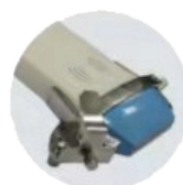
Needle puncture guide